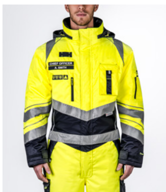
High Viz Yellow