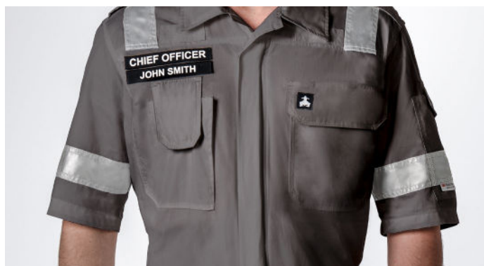
Also available with short sleeves